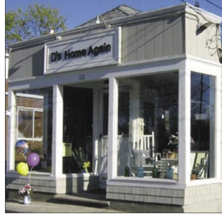
D's Home Again is located at 93 East Falmouth Highway.

D's works with a network of privately owned Cape Cod consignment shops. If they don't have what you're looking for, they will steer you to who may.